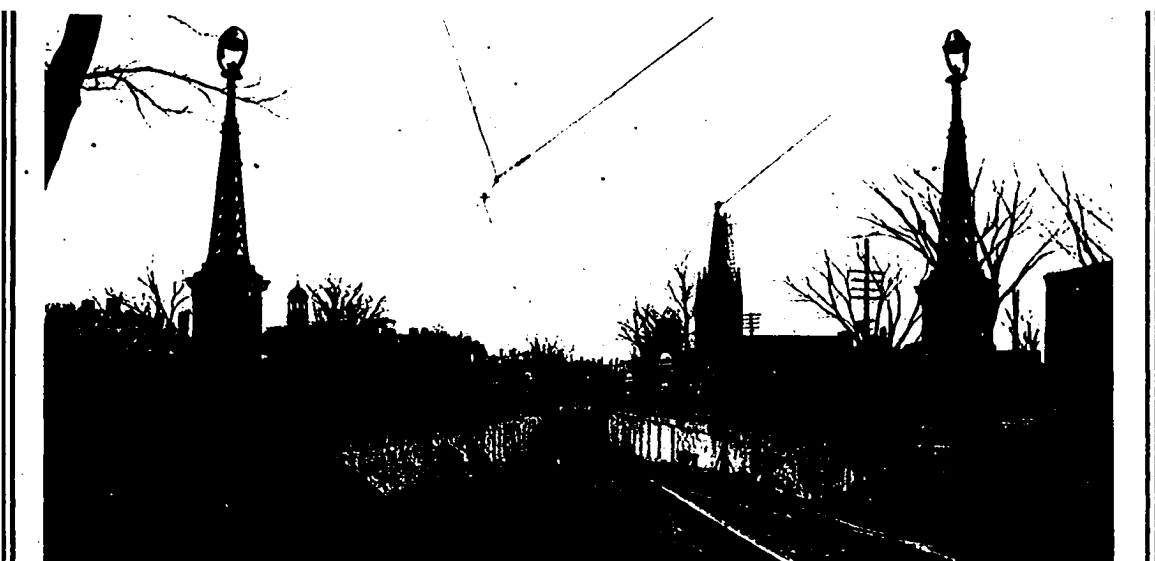
MASSACHUSETTS AVENUE ENTRANCE

The Cambridge Subway of the Boston Elevated Railway Now Nearly Done